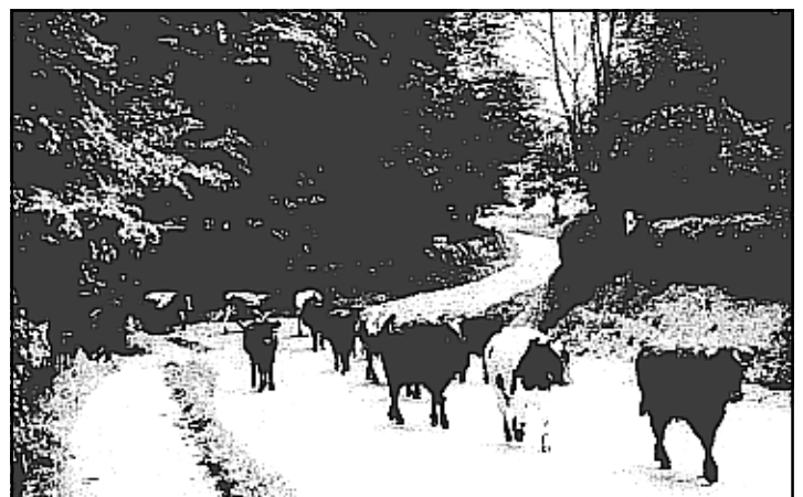
Rectory Road, Roos, when Elm Farm still had a dairy herd.